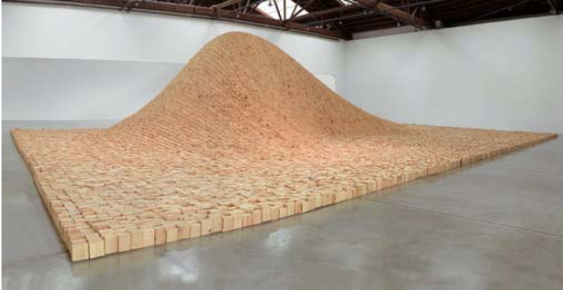
Figure 4: Maya Lin 2 x 4 Landscape , 2006 SFI certified wood 2 x 4s 10' x 53' 4" x 35' (304.8 cm x 1,625.6 cm x 1,066.8 cm)

When compared with 2x4 Landscape , the installation Water Line (Fig. 5, in the foreground), from the Systematic Landscapes series seems more like a drawing in space. Its aluminum tube frame traces out the forms of an underwater mountain range and Bouvet Island near Antarctica. Although the changing patterns made by the contour lines of the mountains are enough to interest a casual observer, the underwater environment that is available for perusal might challenge someone to imagine the unseen in our immediate environments (Beardsley 86). The sculpture is suspended from the walls of the gallery, and the viewer walks below the surface of the ocean floor. Although the title of the piece is Water Line , there is an ambiguity as to where the actual boundary between water and sky is located. By erasing this boundary, Lin challenges us to connect what we might normally see as two separate environments (Lebowitz 156).