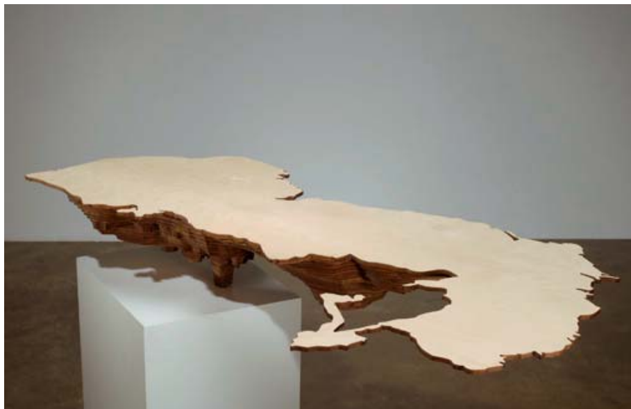
Figure 7: Maya Lin

Caspian Sea (Bodies of Water series), 2006