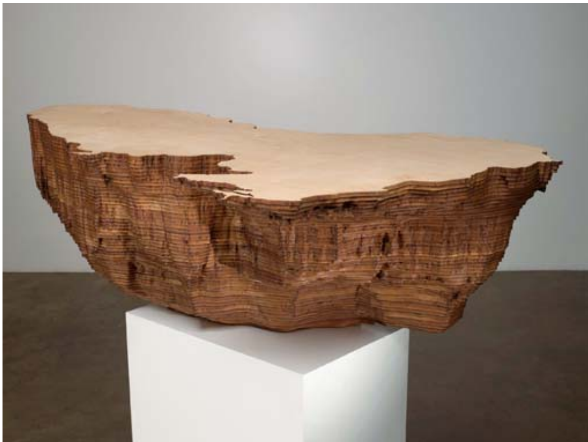
Figure 8: Maya Lin