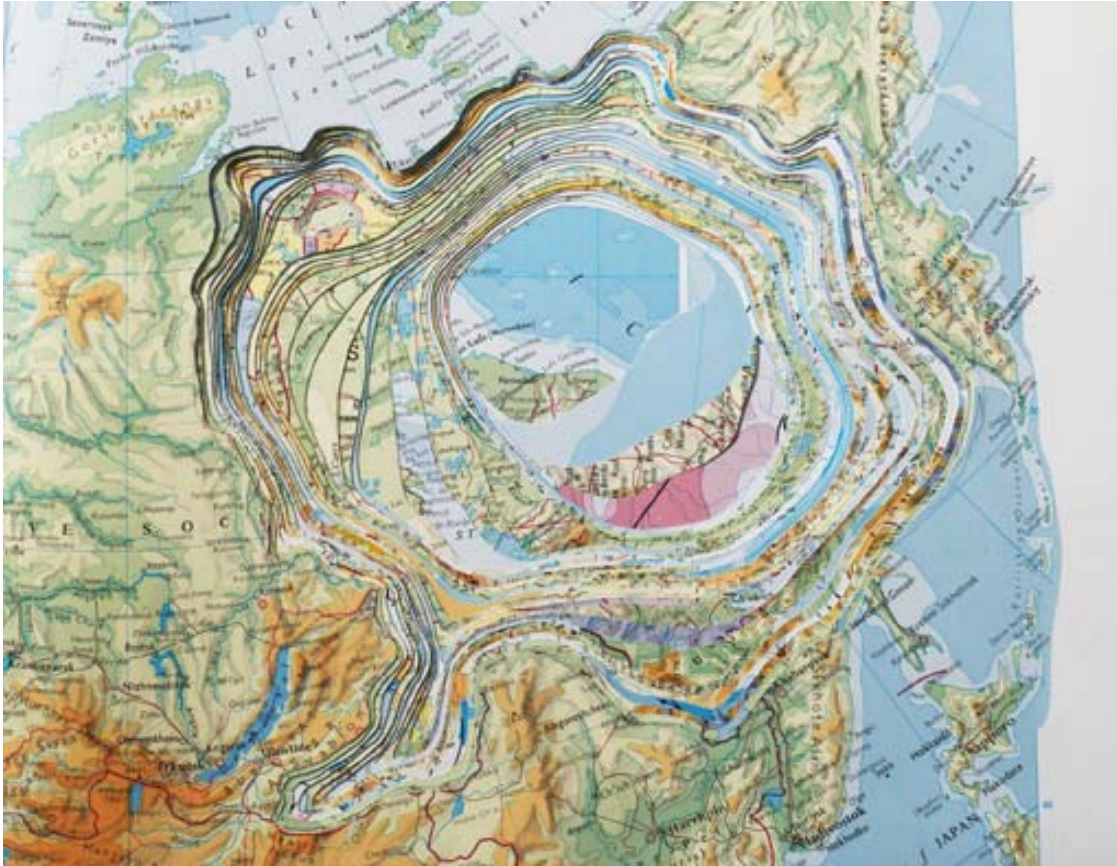
Figure 11: Maya Lin