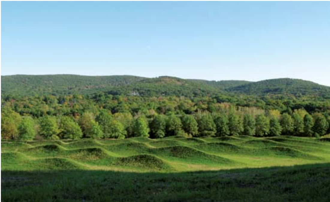
Figure 3: Maya Lin Storm King Wavefield , 2008

Topographic Landscape , from the Topologies series, is the place that the gallery meets Lin's earthworks. 6 The sinuous lines cut into layers of particleboard create an undulating field of waves that allude to sand dunes and snowdrifts. While this large-scale sculpture shares the same visual properties as its outdoor cousins—they are all “inspired by the textures made in sand and the action of waves”— Topographic Landscape is much farther removed from nature (Cotter 8). Despite the further minimizing and abstracting, it is amazing that the use of materials so far removed from their natural form by the manufacturing process can so adeptly mimic the essence of the landscape from which they came.