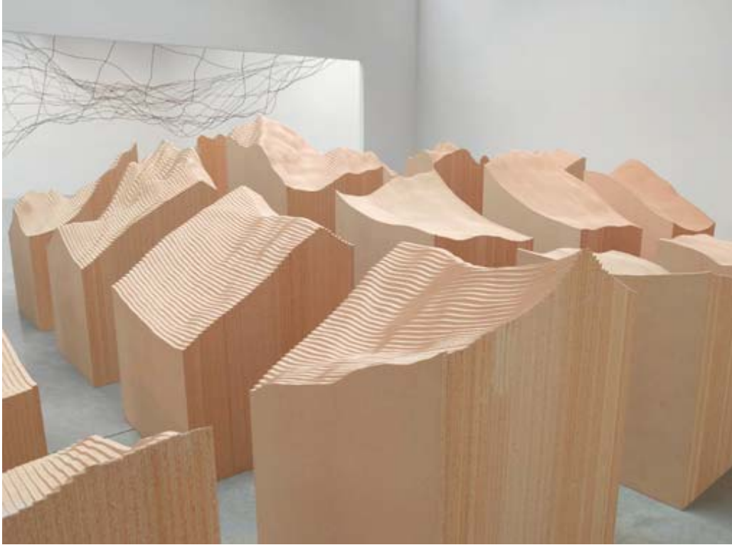
Figure 6: Maya Lin Blue Lake Pass , 2006 Duraflake particleboard installation dimensions variable overall installed: 5' 8" x 22' 5" x 17' 6" (172.7 cm x 683.3 cm x 533.4 cm) 20 block, each from 30" x 36" x 36" (76.2 cm x 91.4 cm x 91.4 cm) to 68" x 36" x 36" (172.7 cm x 91.4 cm x 91.4 cm) Photo by: G.R. Christmas / Courtesy PaceWildenstein, New York © Maya Lin Studio, Inc., courtesy PaceWildenstein, New York

Maya Lin Water Line , 2006 aluminum tubing and paint 19' x 30' x 34' 9" (579.1 cm x 914.4 cm x 1,059.2 cm) Photo by: G.R. Christmas / Courtesy PaceWildenstein, New York © Maya Lin Studio, Inc., courtesy PaceWildenstein, New York