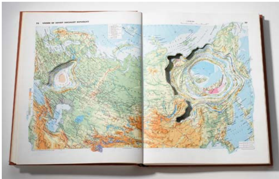
Figure 10: Maya Lin