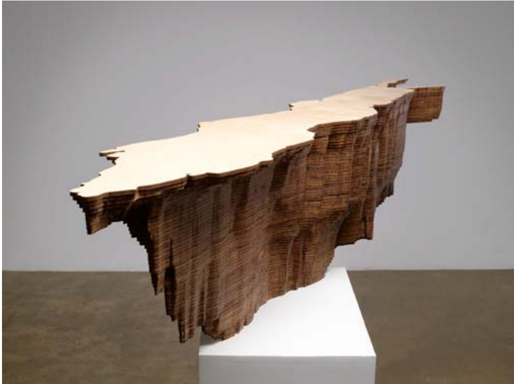
Figure 1: Maya Lin Red Sea (Bodies of Water series), 2006 Baltic birch plywood 21" x 92-1/2" x 17" (53.3 cm x 235 cm x 43.2 cm), sculpture 31" x 30" x 18" (78.7 cm x 76.2 cm x 45.7 cm), base

examine the ways in which Lin connects the viewer to the landscape. (Highlights from the Topologies series include: Avalanche , Rockfield , Flatlands , and Topographic Landscape . The pieces from Systematic Landscapes will include: 2x4 Landscape , Water Line , Blue Lake Pass , Bodies of Water , and Atlas Landscape ).