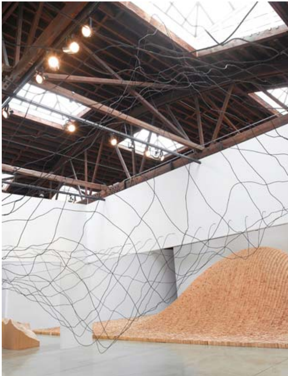
Figure 5: Maya Lin